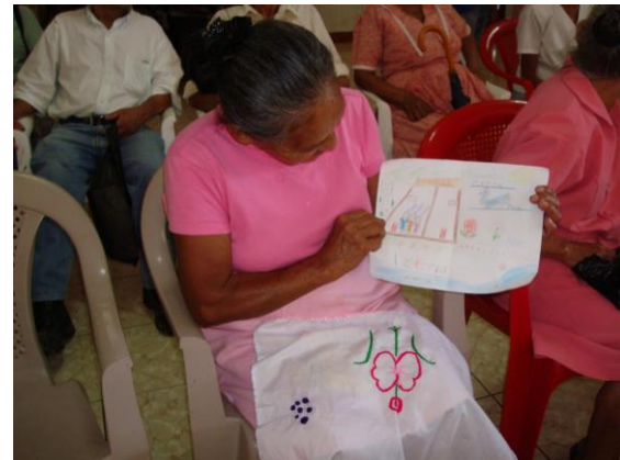
Abuelitos y Abuelitas de Perquin