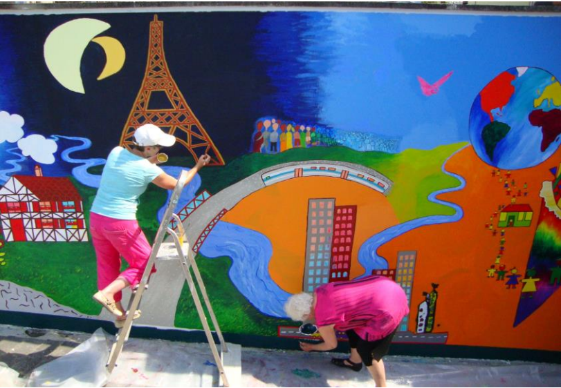
France and Switzerland