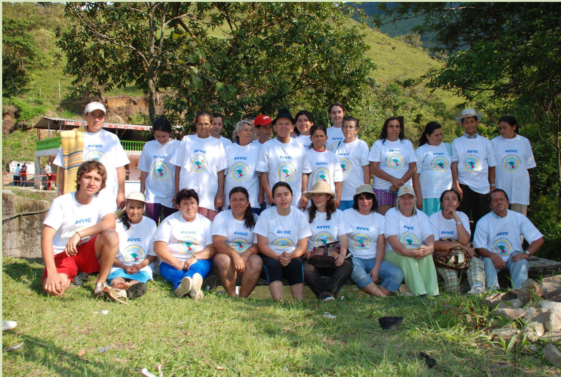
AVVIC, Association of Victims of Violence in Cocorná, Antioquia, Colombia August 1-15, 2009