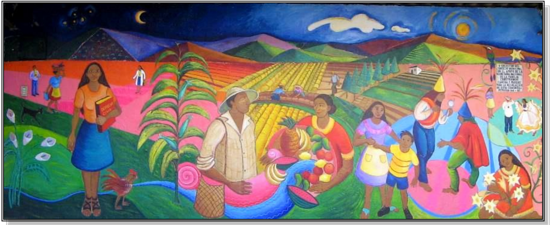
Mural in the Central Park of Perquin