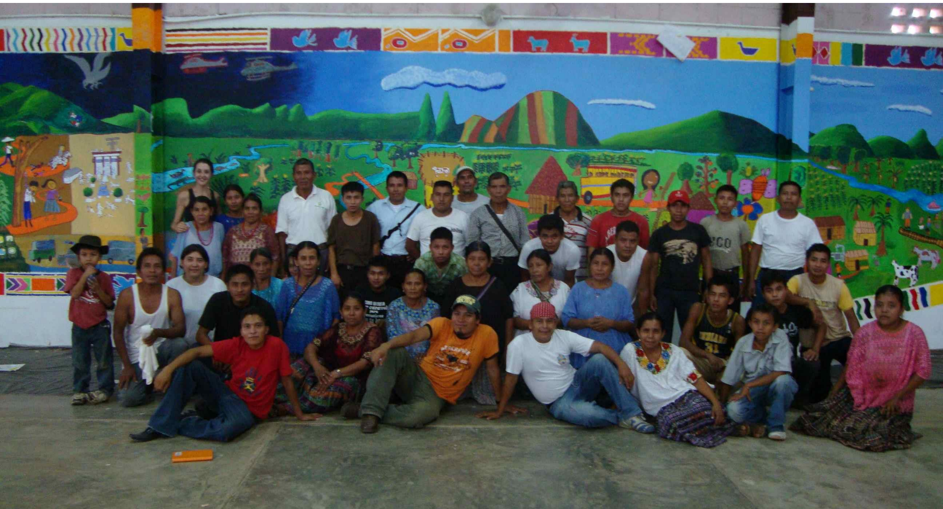
Artists from Panzos