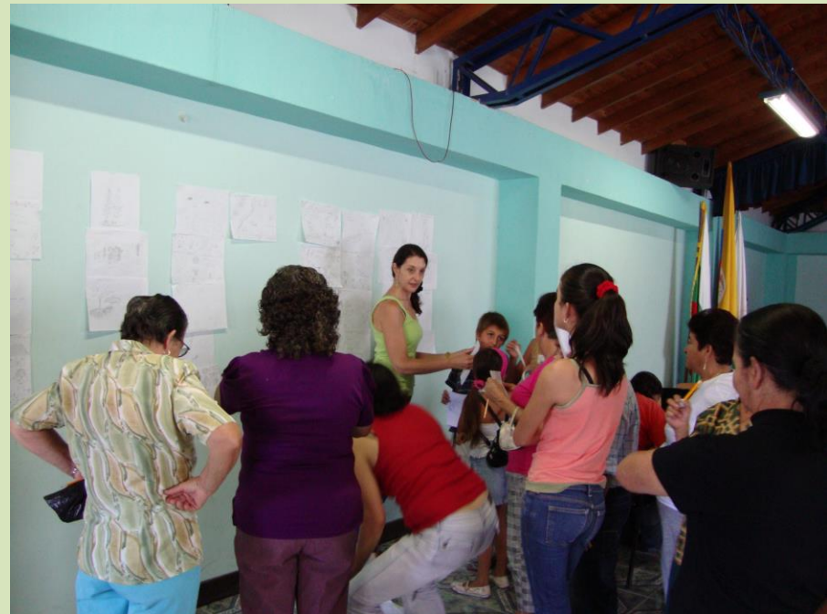
Cultural House Cocorná, Antioquia