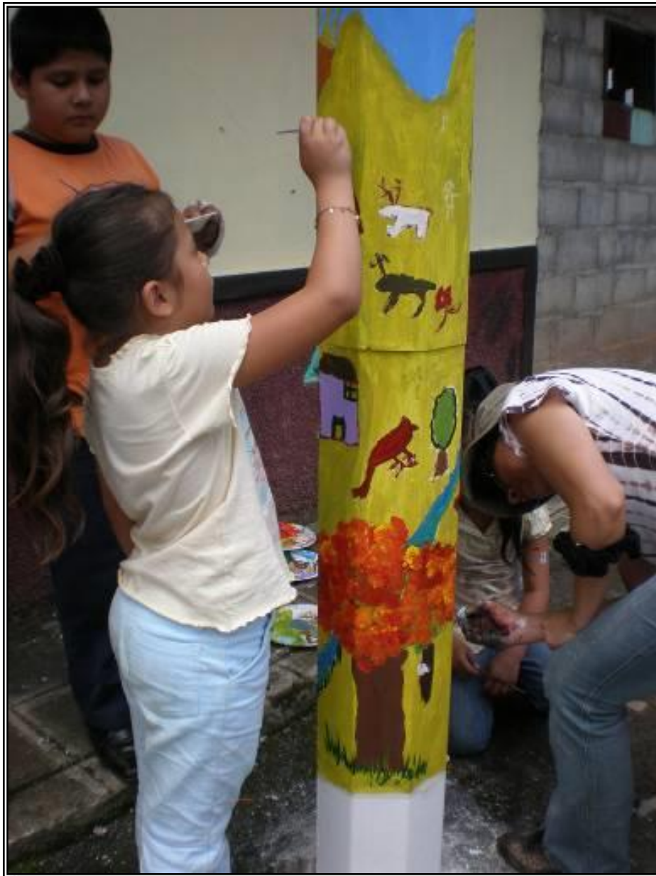
Public Art and Urban Intervention regarding the Rights of Children and Protection to the Environment