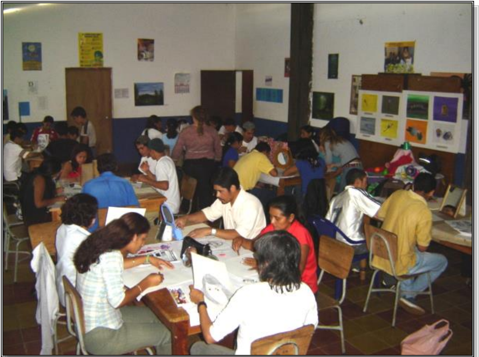
Painting and Drawing Workshops for Youth and Adults