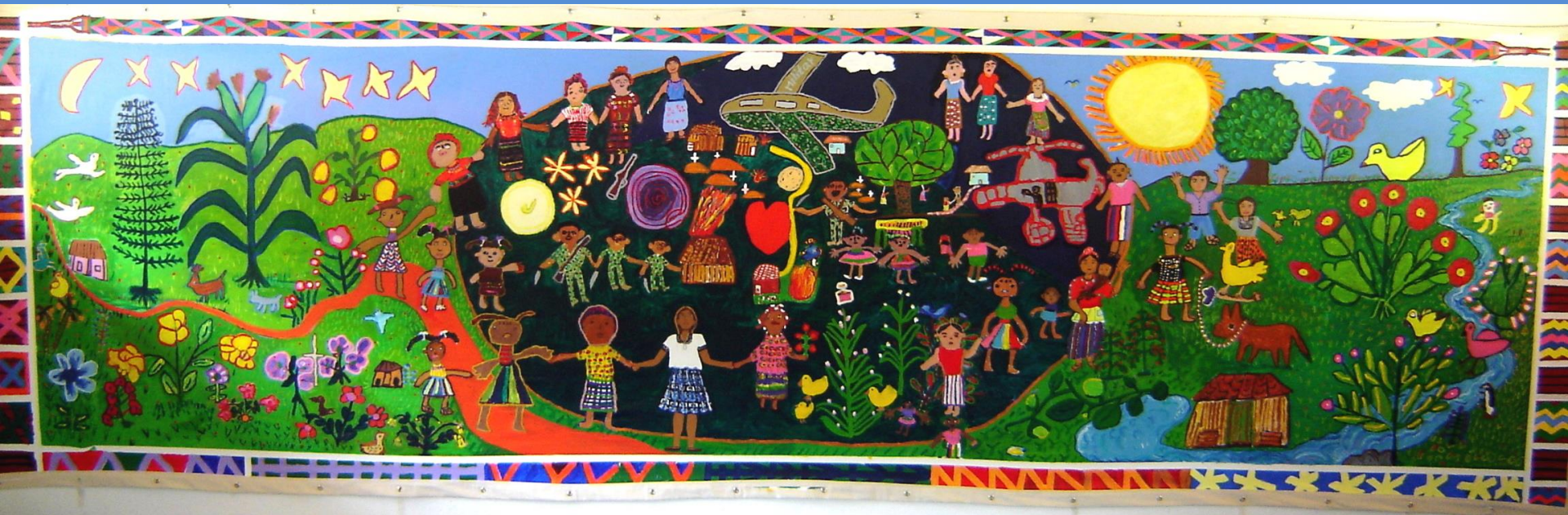
Collaborative mural created by Indigenous Women survivors of sexual violence in Guatemala, psychosocial workers-ECAP - and the School of Art and Open Studio of Perquin. Exhibited at the University of San Carlos in November 2008 and at the National Palace of Guatemala, in February 2009.