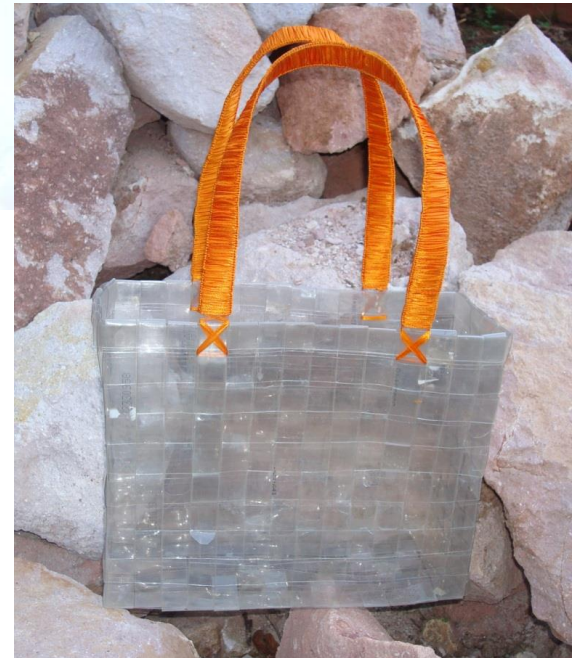
Workshops with Recycled Materials