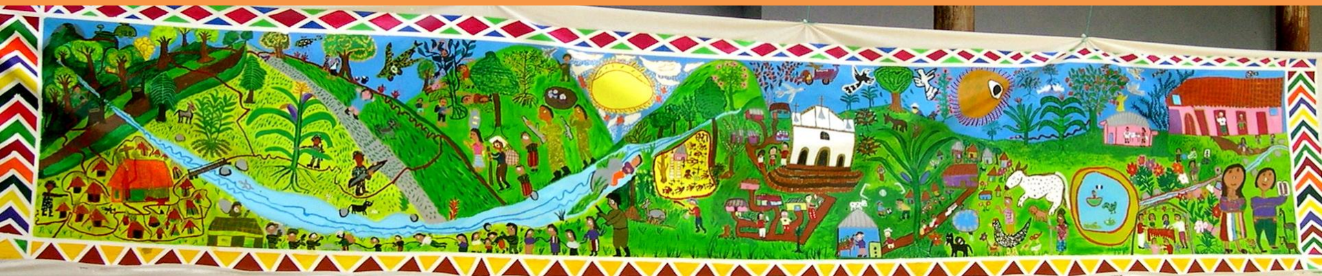
Collaborative mural created by survivors of state violence in Guatemala Psychosocial Workers, ECAP and the School of Art and Open Studio of Perquin