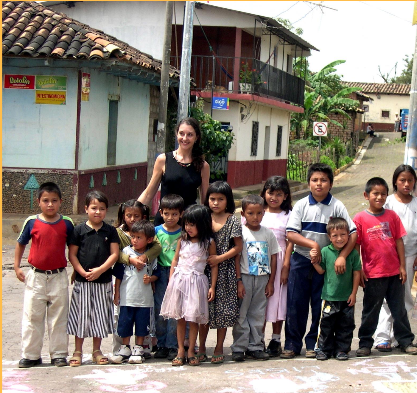
Walls of Hope, PERQUIN