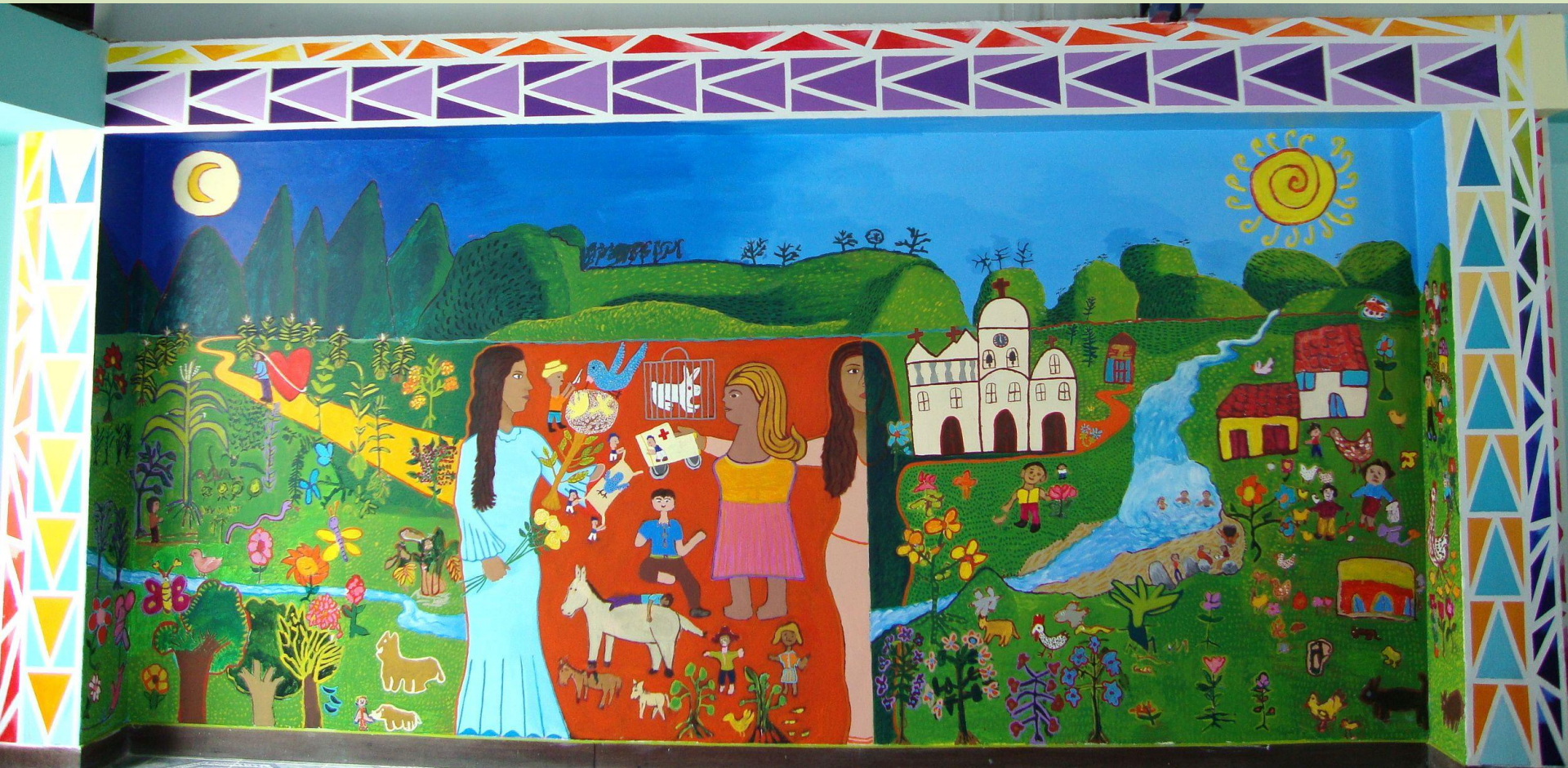
Mural : “Half of Myself/ La Mitad de Mí “