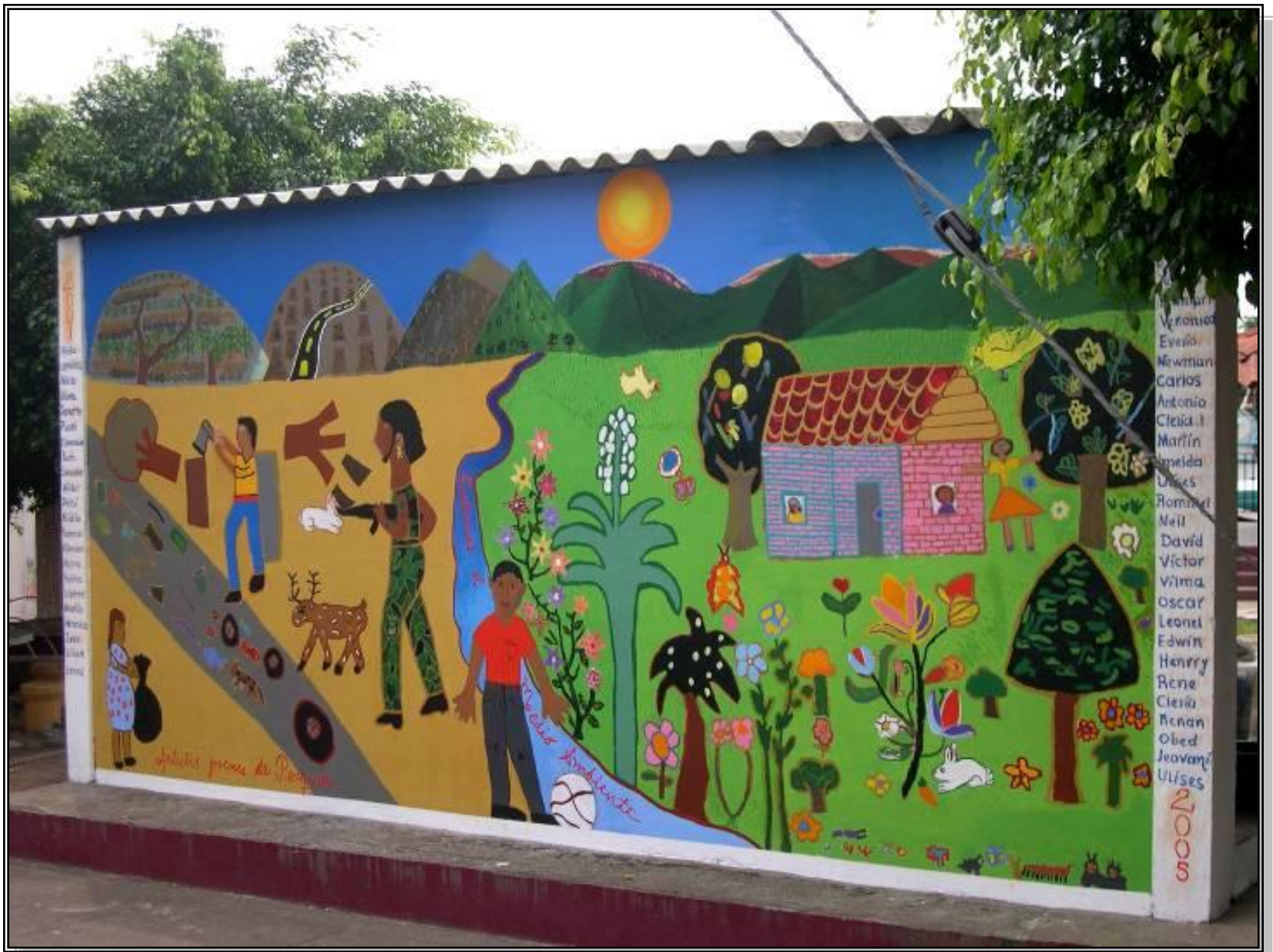
Mural about the Environment, Perquin