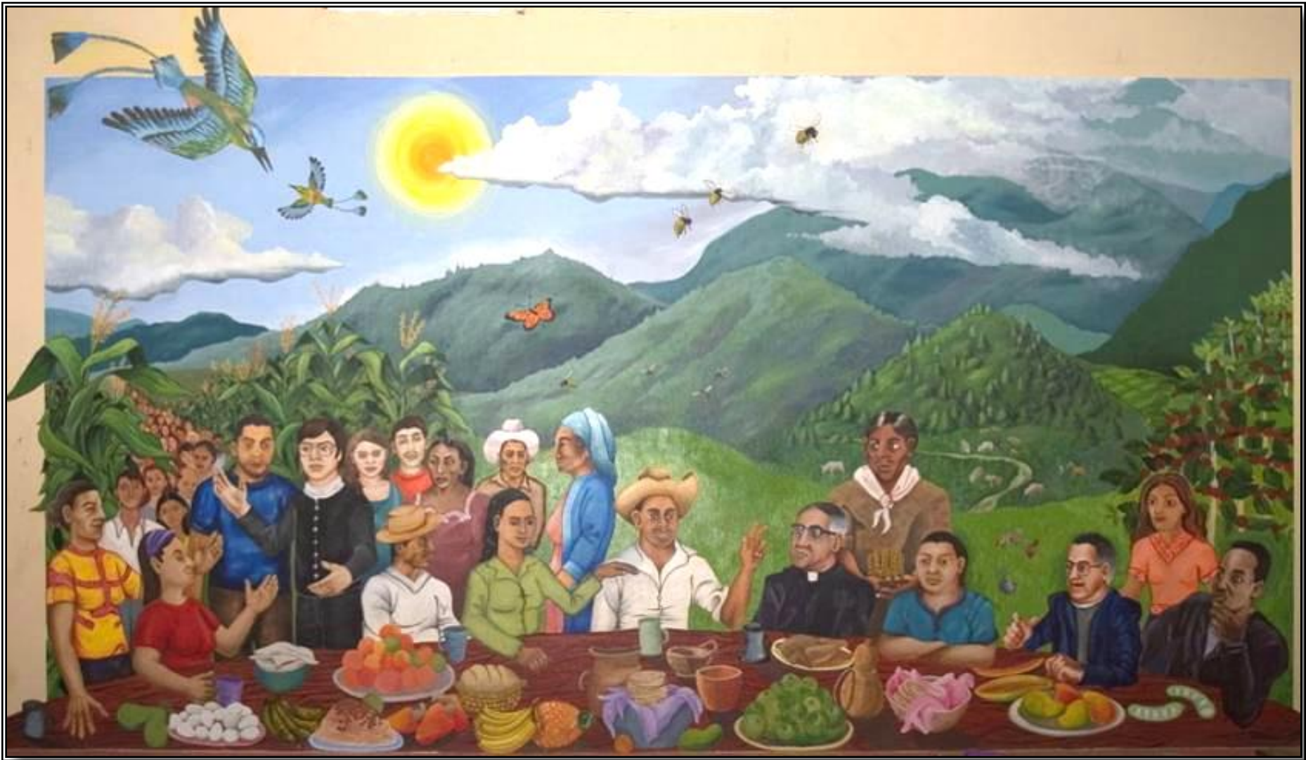
LAST SUPPER OF MORAZAN Mural at the House of CEBES, Perquin