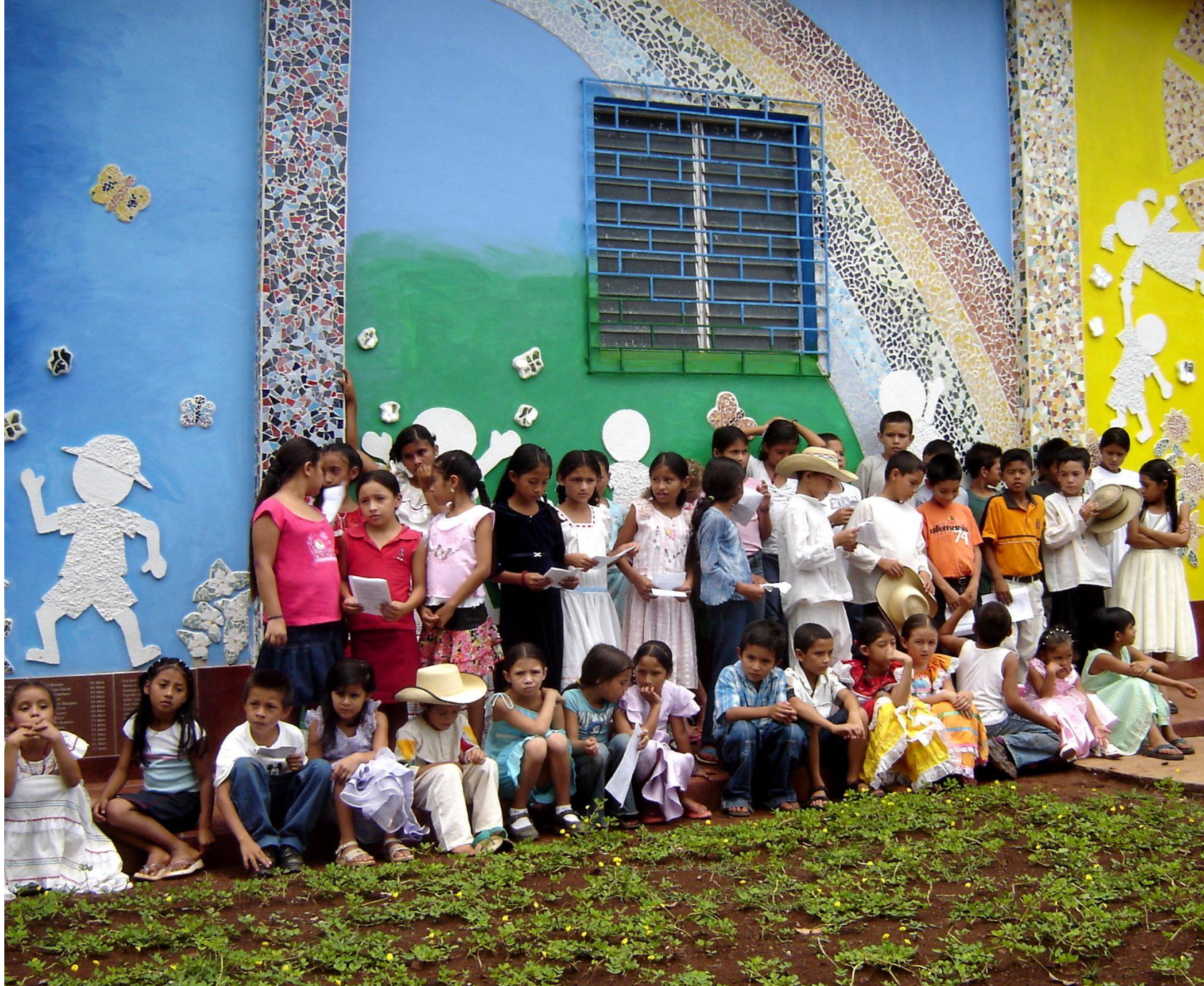
Children of El Mozote, 2012